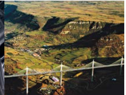
Millau viaduct — Aveyron (France)

CONSTRUCTION CONTRACTOR AND CONCESSION OPERATOR