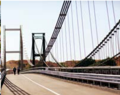
Kamoro bridge — Madagascar