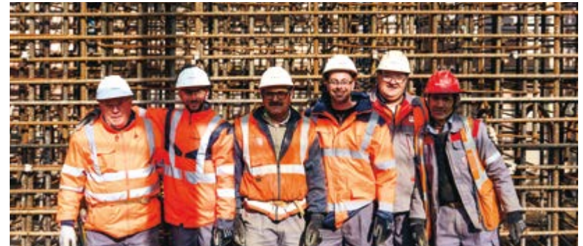
Implicating employees in the success of our projects — In 2017, 40,700 employees subscribed to the capital increase, i.e. 65.2% of eligible employees, for a total amount of €160 million.

Employee share ownership was first introduced in 1989 and swiftly developed in France and abroad. Today, it is part of Eiffage's identity, reflecting our ambition to foster a sense of belonging and let our employees share in the success of our projects and the results of our growth.