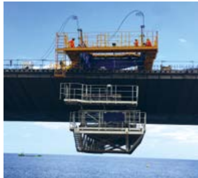
Reunion Island — 47,600 work integration hours were conducted through the Grande Chaloupe viaduct project. Seven individuals were hired during the project.