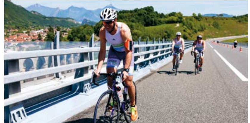
Grenoble (France) —

Eiffage has always attached great importance to sport. Whether initiated spontaneously by employees or instigated by the Group, sport unites us around the shared goal of tackling challenges together and flying Eiffage's colours.