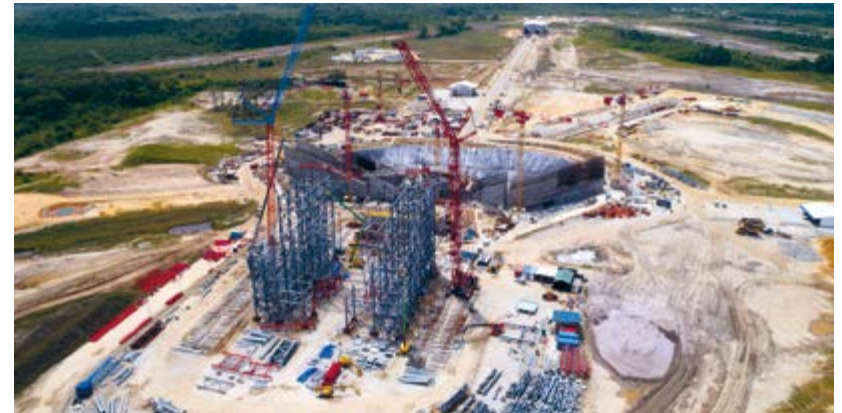
Kourou (French Guiana) — The Eclair6 consortium led by Eiffage continued work building infrastructures for ELA 4, the new Ariane 6 launch complex, scheduled for handover in 2018.

Both in France and further afield, we work alongside leading industrial firms in the aviation, automotive, nuclear, petrochemicals, health and construction sectors, sharing our expertise in industrial systems design, integration and maintenance, as well as production, testing, inspection and compliance assessment processes.