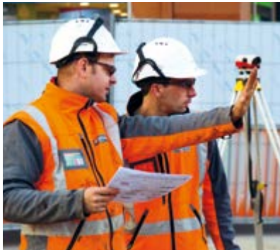
Companies and Neighbourhoods Charter — The integration of young people from disadvantaged neighbourhoods is addressed through a specific Group policy in the Companies and Neighbourhoods Charter.

Eiffage strives to give as many people who are unqualified or experiencing difficulty finding work a chance to earn a qualification and have a long-term career in a large company. This commitment is reflected in the work integration policy deployed in all the Group's entities, in partnership with local integration specialists.