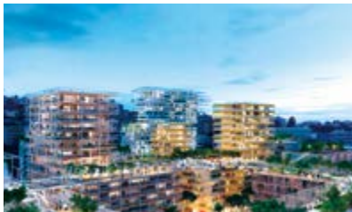
Nice (France) — We provide our expertise to local authorities as they design large-scale urban projects.

Building a sustainable city implies ensuring that its constituent neighbourhoods are able to adapt to new lifestyles and change over time. It is also important to offer residents a high quality of life, by providing affordable, eco-friendly buildings, shared utility networks, and safe, environmentally sound communities. We apply all our expertise to make towns and cities more resilient to the consequences of climate change, more beautiful, more effectively integrated and better adapted to the needs of all generations, both now and in the future.