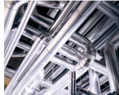
Clévia — The new brand for energy and climate engineering activities