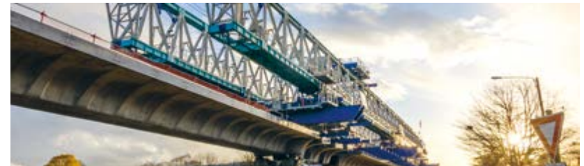
Rennes Metro (France) — By September 2017, more than half of the viaduct deck sections had already been built, representing a total length exceeding 1,200 m.

As an infrastructure builder and manager, we are one of the key stakeholders in land development efforts in France and around the world. Drawing on our wide-ranging expertise in roads and motorways, tramways, metro and railway lines, docks and ship locks, we facilitate urban and intercity travel, modernising infrastructures, building missing links and creating new transport corridors. We are reinventing means of transport and fostering innovative travel practices to serve users more effectively.