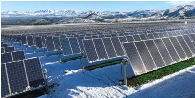
Photovoltaic power plant, Quilapilún (Chile) — Eiffage Énergie Systèmes, through its Spanish subsidiary Eiffage Energía, is building the installations of this 98 MW power plant.

As a result of our collaborative innovation policy and sustained investment in research and development, we are now a major player in low-carbon construction, sustainable roads and renewable energy, enabling us to tackle the major environmental challenges of the 21st century.