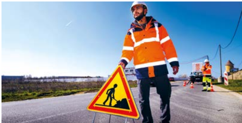
Promoting best practices —

Prevention and safety in the workplace are fundamental focus areas of the Eiffage 2020 strategic plan, and two priority goals. Extensive efforts, including awareness campaigns, training and safety audits, are being rolled out across the Eiffage Group to encourage safe practices and ultimately achieve the zero-risk target.