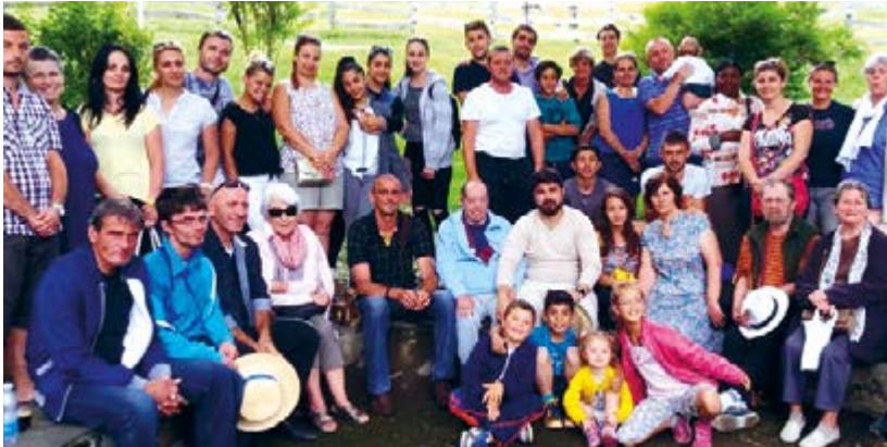
Bordeaux (France) —

Founded in 2008, the Eiffage Foundation has supported over 200 projects in nine years. It pursues the mission of contributing to the social and work integration of people in difficulty. In 2018, the emphasis is on one of the Eiffage Foundation's core focuses: the citizen commitment of Group employees.