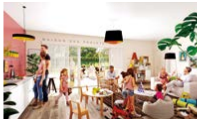
Cocoon'Agés (France) — This inter-generational housing concept is on display at the showroom in Aubagne, South of France.

Created in 2017, Eiffage Construction Bois offers environmentally friendly, flexible and responsive turnkey solutions that supplement the conventional wood industry.