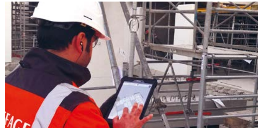
Continuous training —

Training our employees is a key factor for the success of our Group, allowing us to support careers while developing the skills Eiffage needs to prepare for the future.