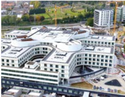
Chirec Hospital — Auderghem (Belgium)